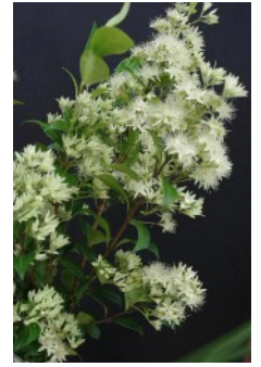
Above: Oakleaf, Lace cap and Mophead Hydrangeas and a pretty Deutzia