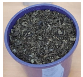
Above: Two summer reds, Tomatoes and Strawberries, Carrots and delectable compost