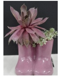
Above: A Dendrobium orchid, Tillandsia, Leptospermum (Tea Tree) and a container of Succulents Below: Roses in all their form and glory